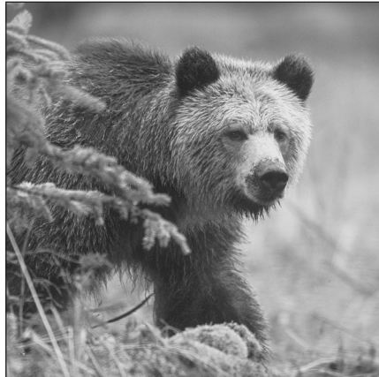
BC Government stands by while EU bans Grizzly trophy imports.

In November 2003, key findings from independent analysis demonstrated that 40-60 percent of the landbase would need to be conserved in order to protect at least 30 percent of the habitat of rare and threatened species. The table's protection recommendation falls short of this threshold, so managing activities outside of the protection areas and ensuring strong implementation of EBM become critical issues in ensuring that EBM hits the ground in an ecologically-defensible manner. No multi-stakeholder process is ever going to produce a 'perfect' environmental