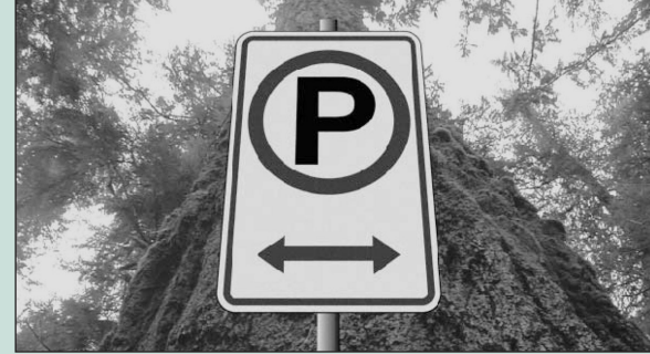
Paving Paradise in Cathedral Grove will generate "Hot" wood.

This is an "environmental" news story of the decade. Already protesters have been defying loggers for a full month while waiting for an injunction, which if served will see them